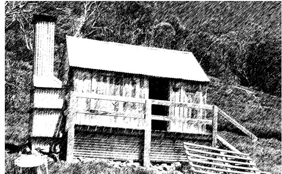
Silver Brumby Hut Plains of Heaven, Swindler's Creek

The original Silver Brumby Hut was built in 1992 as a temporary film prop for the Australian film "The Silver Brumby" , based on the famous novel by Elyne Mitchell. The present hut was built in 2006-7 as a replica of the original. A joint project of the Rotary Club of Sale Central, East Gippsland Institute of Tafe, Tanderra Ski Club and the Mt Hotham Resort Management Board. Situated in the Plains of Heaven on Swindler's Creek, the location is an ideal spot for a picnic lunch.