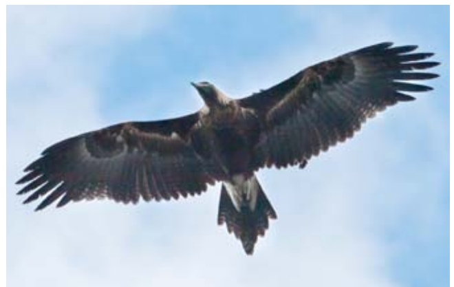
Wedge Tailed Eagle

Starting at the Dinner Plain end at the 200 metre mark of the walk, a side path leads to the CRB (Country Roads Board) Hut at the roadside. Built in 1926, it survived the Black Friday fires of 1939 and is regarded as the best preserved CRB hut of its type in Victoria. It was one of a series of such huts built to shelter patrolmen working to keep the Great Alpine Road open during the non-winter months. Construction of the road began in 1874 and was completed in 1883, enabling miners and others to travel across the Alps from Harrietville to Omeo.