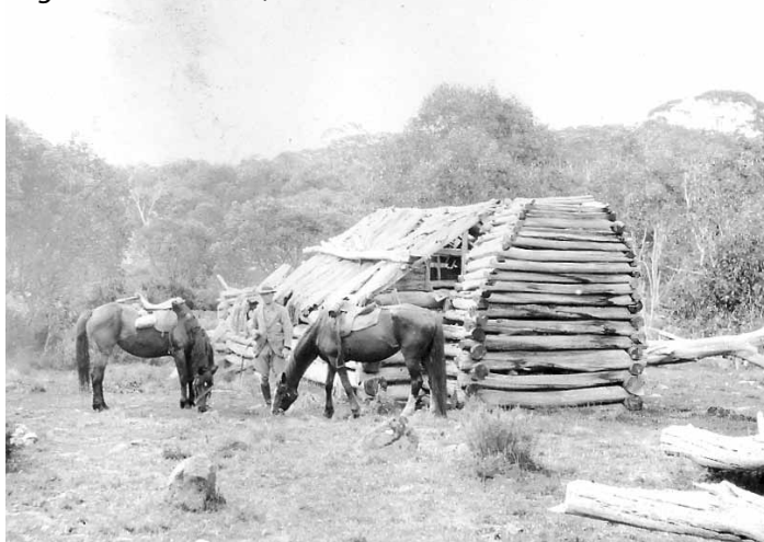
Precipice Plain Hut, circa 1920s.

The Montane Track – another fine walking trail from Dinner Plain - parallels the road near Precipice Plain and two access points are clearly marked, offering a return option to Dinner Plain for walkers or bikers wishing to complete a (much longer) trail loop ( see Montane Walking Trail track notes )