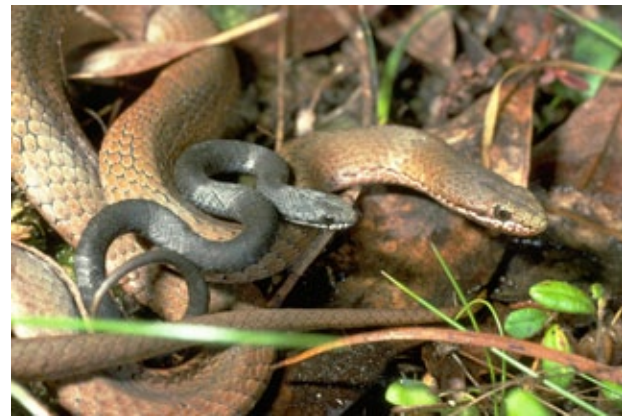
White Lipped Snake and young.

Precipice Plain itself is on private land, surrounded by the Alpine National Park to the west, State Forest to the south and north and private land to the east. The freehold lot resulted from conditional purchase rights granted over crown land in 1926. It was originally part of a large grazing lease taken out by Jens Petersen around 1865 that extended from JB Plain eastwards into the Victoria River catchment and downstream towards Cobungra. The land was purchased in the 1940s by Cobungra Pastoral Station. Until it was destroyed in the 1939 fires cattlemen used a log hut (pictured) on the Plain as shelter in bad weather or while mustering.