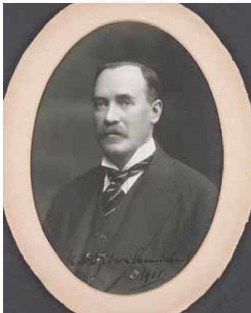
Sir Thomas Gibson Carmichael.

Dropping 25 metres over basalt cliffs, the falls are in the headwaters of Precipice Creek and the Dargo River, among the many waterways feeding the major catchments arising at the Dinner Plain plateau. The actual falls are in fact two falls side by side at the confluence of the Precipice and Dinner Plain Creeks which rise in the alpine bogs of the Dinner Plain Village.